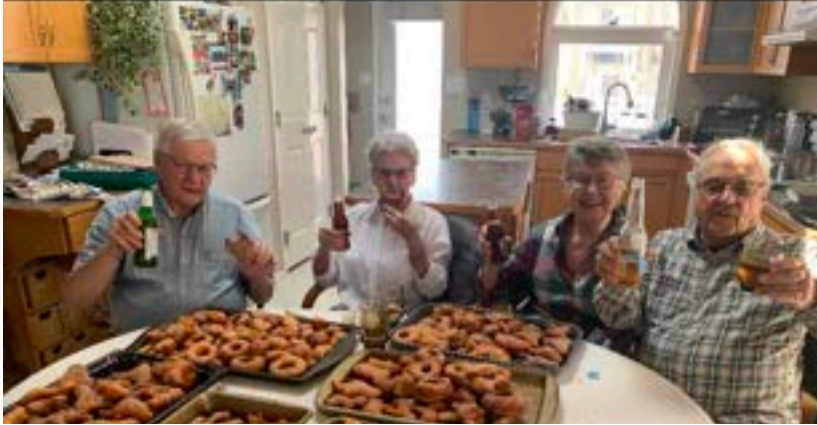
Cheers to Spudnuts!